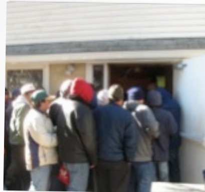
WAITING FOR LUNCH.