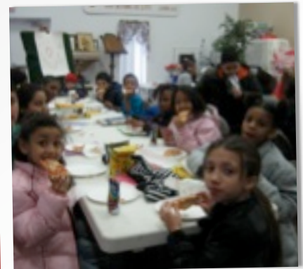
ENJOYING VALENTINE'S DAY PIZZA PARTY!