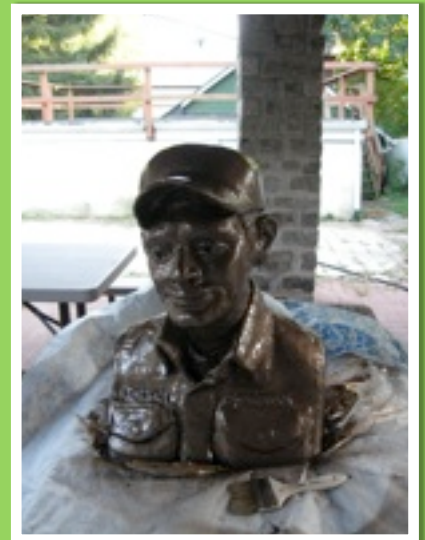
Sculpted bust donated for memorial garden. Several memorials will be displayed