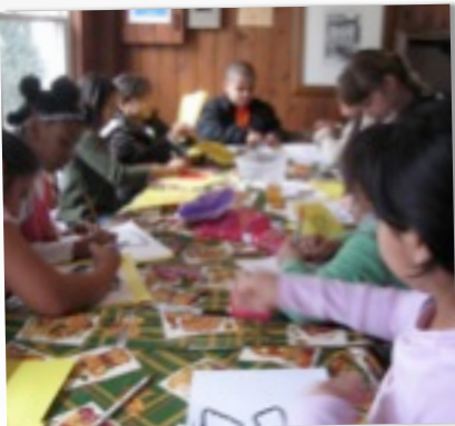
HDE CRAFT TIME

frozen foods, and whatever is available on a weekly basis. We are grateful that at a time when the need continues to increase, through God's faithfulness, provision and the support of many, we are able to meet the needs of those that come in need of a Helping Hand.